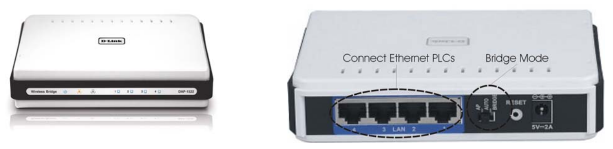
Figure 1: Front View

http://www.dlink.com/products/?pid=DAP-1522&tab=3.addition